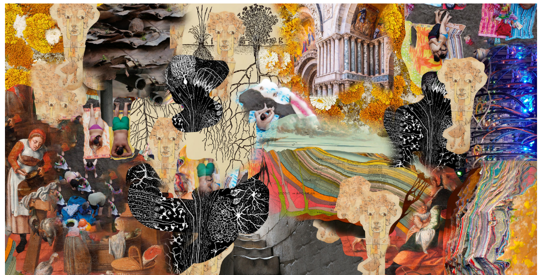
Collage of digitally manipulated images by Judith Musachs and Pol Pérez selected by the curatorial team.

With this call for participants, the Congress aims to bring together knowledge across research, practice and education to provoke new perspectives and new alliances, reshaping architectural thinking and action.